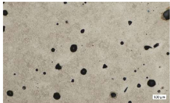
As quenched and tempered (oil quenched +300 °C, 1 h)