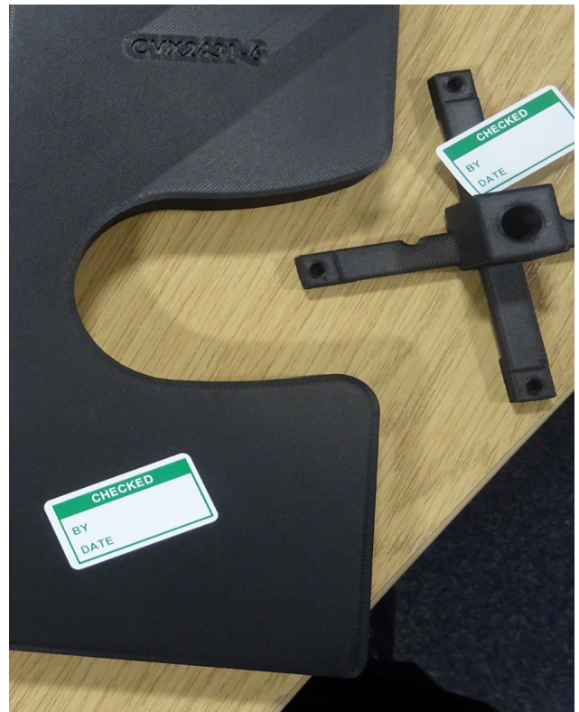
The team has replaced several parts with 3D printed parts using Markforged's Onyx material